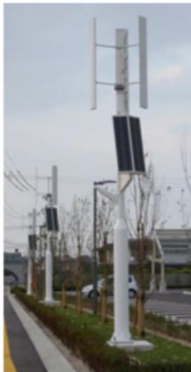
Streetlight with a small wind power generator

While the investment by Riken Green Life Innovation Fund financially assists this new development project, WINPRO positively conducts technical development and stock offering (IPO) activities, taking advantage of the hands-on function of Riken Innovation Capital Co., Ltd.