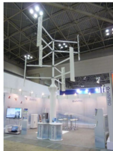
Exhibition at WIND EXPO 2014